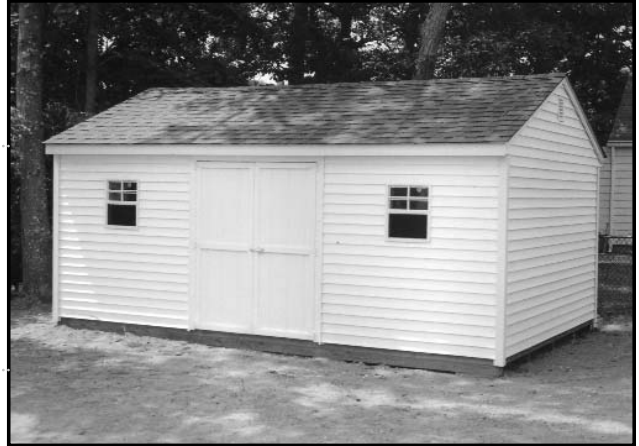
8' x 10' includes 1 window. 8' x 12' and larger includes 2 windows.

Vinyl sheds are maintenance free, come with wood door painted same color as vinyl, shutters.